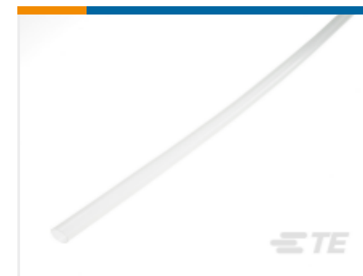
TE Part #CR1178-000 MT-LWA-1/8-X-STK