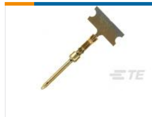
TE Part #66682-2 20 DF PIN PLATED