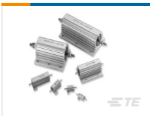
TE Part #3-1625985-4 Power Resistors: Aluminum Housed, NHS