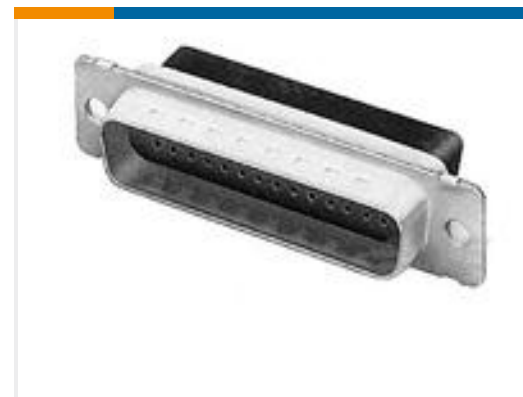
TE Part #748364-1 15 HD22 CRIMP SNAP PLUG