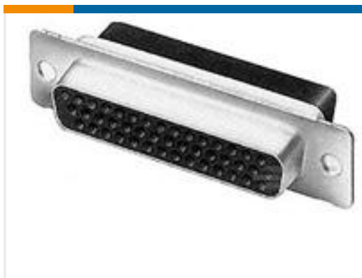
TE Part #1658681-1 HDP-22,RCPT,SIZE 1,15 POSN