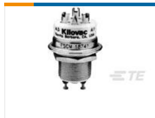
TE Part #3-1618274-8 HC-3/12VDC=RELAY, VACUUM, SPDT