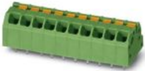
The figure shows 10-pos. standard item (without EX marking)

PCB terminal block, nominal current: 16 A, nominal cross section: 1.5 mm 2 , Number of rows: 1, Number of positions per row: 2, product range: SPTAF 1/..-IL-EX, pitch: 3.5 mm, connection method: Push-in spring connection, mounting: Wave soldering, conductor/PCB connection direction: 45 °, color: green, Pin layout: Linear pinning, Solder pin [P]: 2.6 mm, type of packaging: Tray