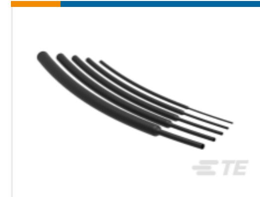
TE Part #245783N001 RNF-100-3/16-BK-SP-CS5004