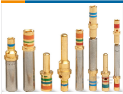
TE Part #4102-18-1131 CONT SOC ASSY