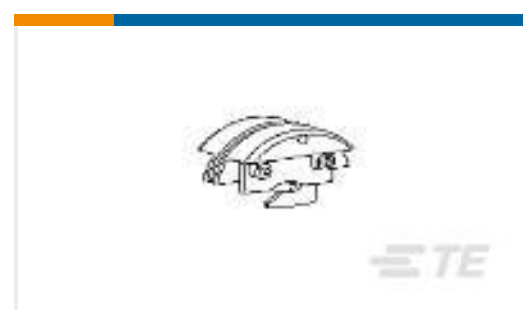
TE Part #1490414-1 HYP10 SOLIS 8AWG INDENTER