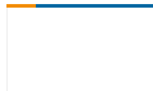
TE Part #YD8170E27-0PNC1270 RECP ASSY