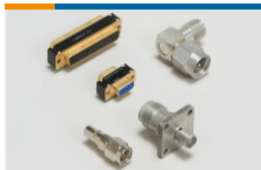
Connector Adapters & Connector Savers(10)