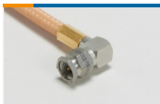
RF Cable Assemblies(2)