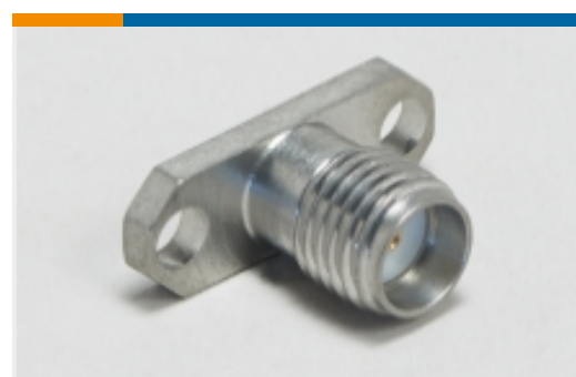
RF Connector Launchers(7)