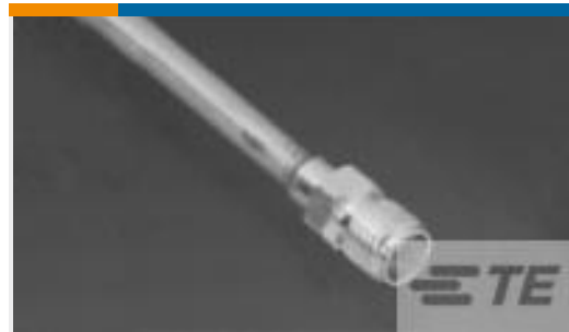
TE Part #1050859-1 2002 5016 00