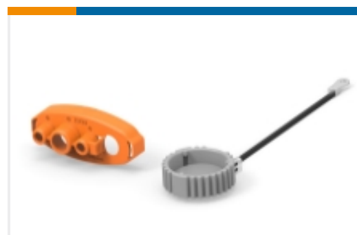
Connector Caps & Covers(3)