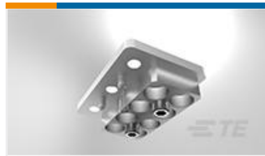
TE Part #2157553-1 RF BACKPLANE MODULE 8 POS