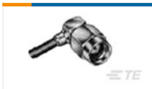
TE Part #1045423-1 SSMA R/A Cable Plug 1007 7985 02