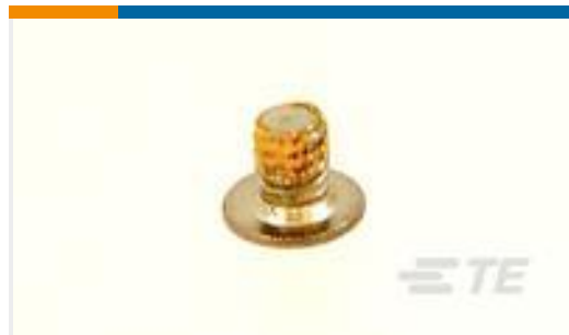
TE Part #1410946-2 MULTI-GIG SOC. CAP SCREW, CUSTOMIZED HDW