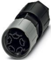
QUICKON connector, black, 4+PE-pos., 1.0 mm 2 ... 2.5 mm 2 /690 V/20 A, with QUICKON nut, for cables with 6 mm ... 11 mm diameter.

Please be informed that the data shown in this PDF Document is generated from our Online Catalog. Please find the complete data in the user's documentation. Our General Terms of Use for Downloads are valid ( http://phoenixcontact.com/download )