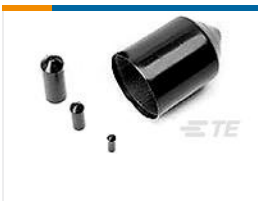
TE Part #843037-000 101A062-3-0