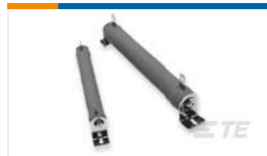
TE Part #2-1879457-6 TE 2500W 120R 5% Bracket