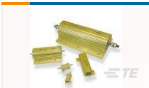
TE Part #4-1630019-8 HSC200 22K 5%