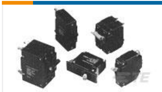
TE Part #6-1393252-1 W67-X2Q12-30=M6/M7/M9/W6/W7