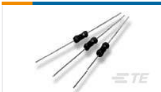
TE Part #7-1625890-0 2W SM M/OX 5% 82K