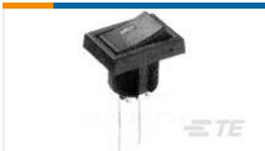
TE Part #5-1437595-2 TRD11F10WL=SUB MINI ROCKER BLA