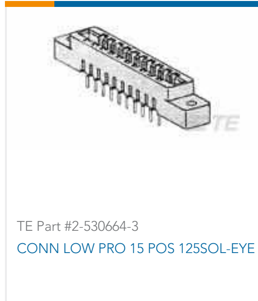
TE Part #2-530664-3 CONN LOW PRO 15 POS 125SOL-EYE