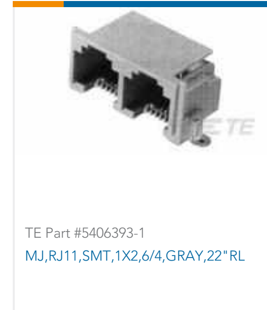
TE Part #5406393-1 MJ,RJ11,SMT,1X2,6/4,GRAY,22"RL