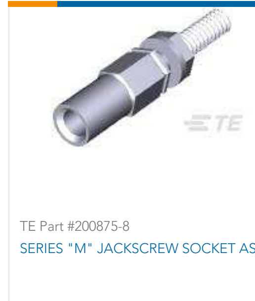
TE Part #200875-8 SERIES "M" JACKSCREW SOCKET AS