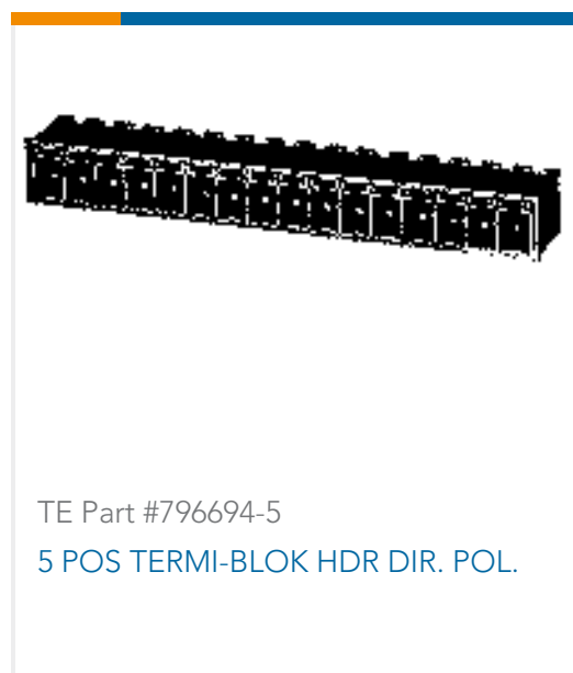
TE Part #796694-5 5 POS TERMI-BLOK HDR DIR. POL.