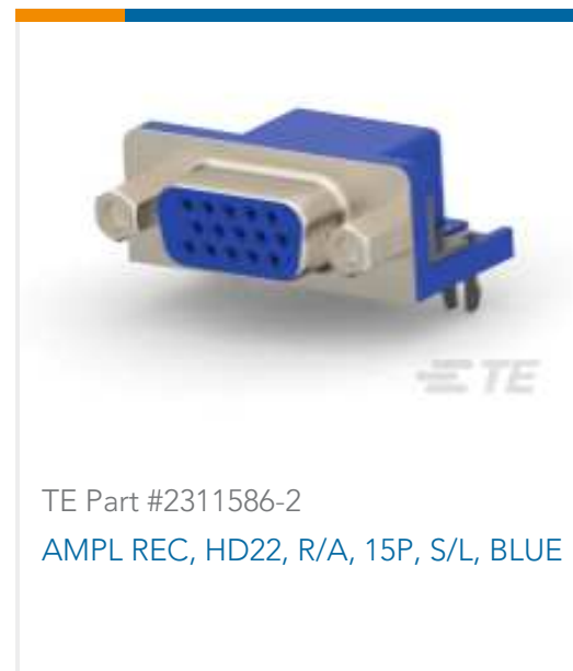
TE Part #2311586-2 AMPL REC, HD22, R/A, 15P, S/L, BLUE