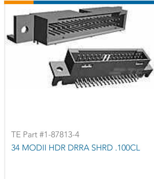
TE Part #1-87813-4 34 MODII HDR DRRA SHRD .100CL