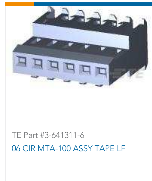
TE Part #3-641311-6 06 CIR MTA-100 ASSY TAPE LF