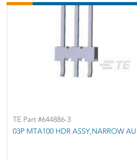
TE Part #644886-3 03P MTA100 HDR ASSY,NARROW AU