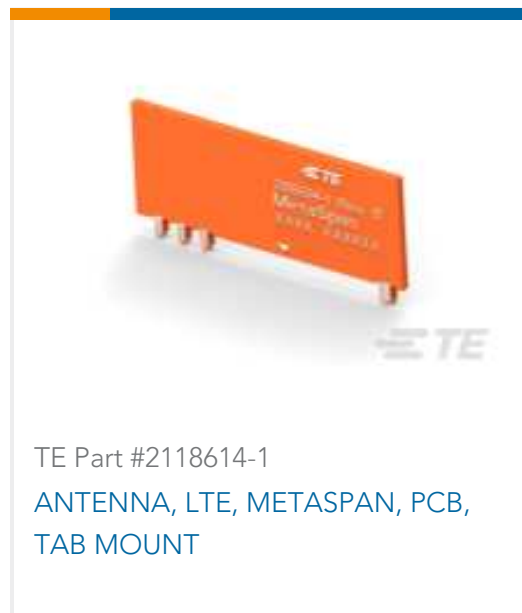
TE Part #2118614-1 ANTENNA, LTE, METASPAN, PCB, TAB MOUNT