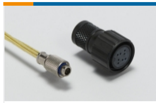
Standard Circular Connectors(124)