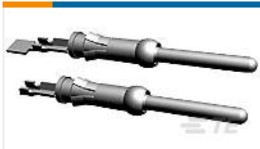
TE Part #66103-3 III+ PIN,24-20,15AU/FL,LP