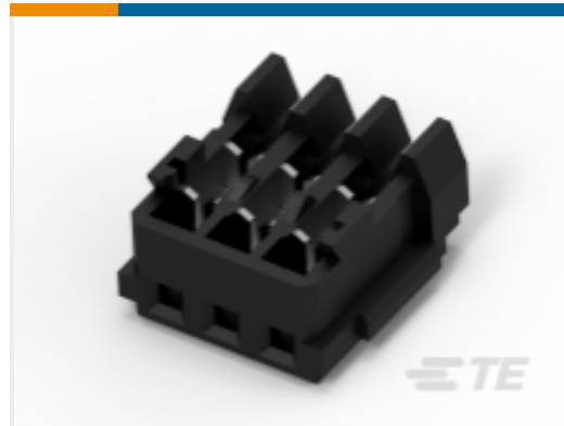
TE Part #2-353293-3 1.5MM CT MT REC ASS'Y 3P BLACK