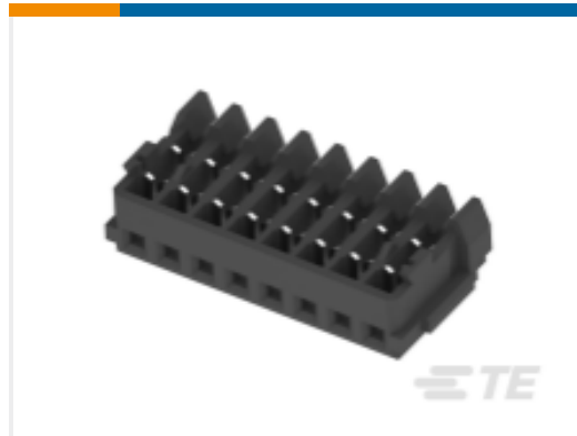
TE Part #2-353293-8 1.5MM CT MT REC ASS'Y 8P BLACK