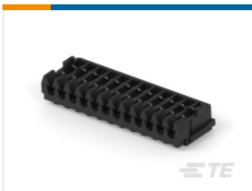
TE Part #3-353293-2 1.5MM CT MT REC ASSY 12P BLACK