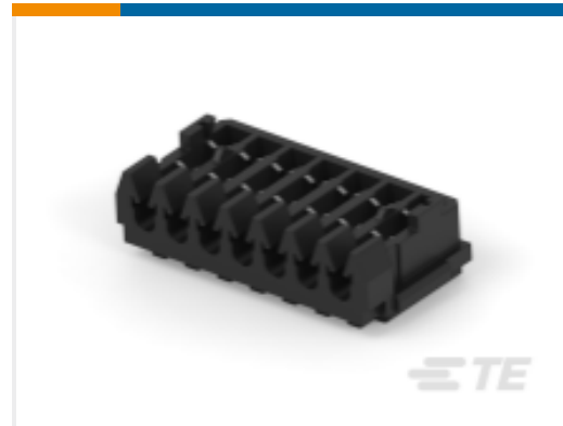
TE Part #2-353293-7 1.5MM CT MT REC ASS'Y 7P BLACK