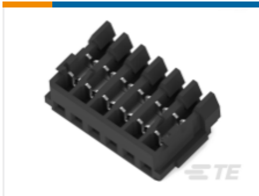
TE Part #2-353293-6 1.5MM CT MT REC ASS'Y 6P BLACK