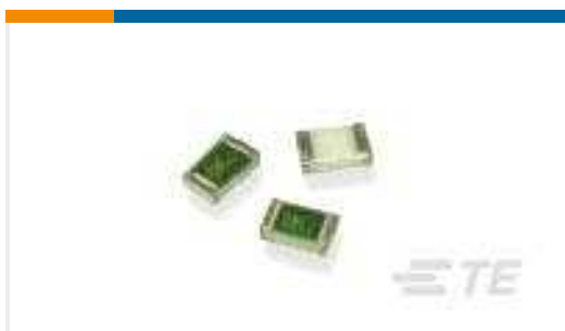
TE Model / Part #5-2176089-4 RP 1J 0.166W 40K2 0.1% 25PPM 1K RL