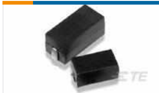
TE Model / Part #1-1879021-1 SMW3 R27 5%