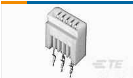
TE Model / Part #2-84984-0 1mm FFC DIP V ASSY 20P NAT(TB)