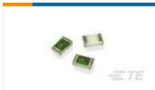
TE Model / Part #5-1879028-7 RN 0805 187K 0.1% 10PPM 1K RL