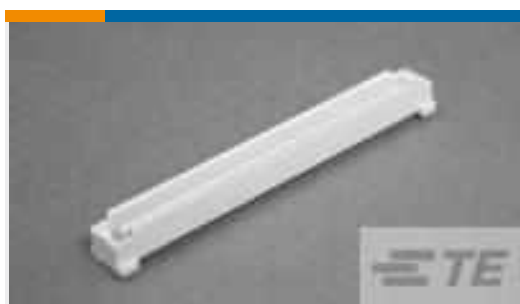
TE Model / Part #5177984-8 0.8FH,P05H.5,160,08/Sn,TU