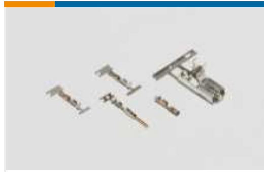
Wire-to-Board Connector Contacts(4)