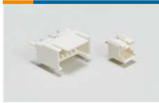
Wire-to-Board Headers & Receptacles (82)