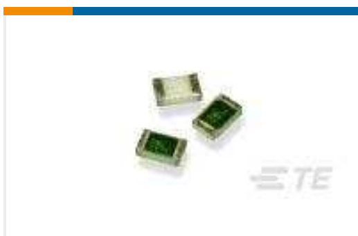
TE Part #9-1879215-1 CPF 0402 40K2 0.1% 25PPM 1K RL