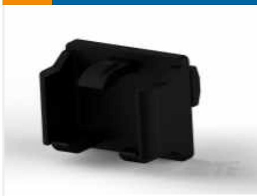
TE Part # 1761394-1 DUST COVER, SFP, GANGED & STACKED