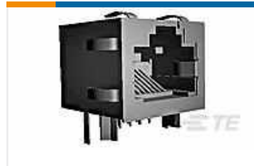
TE Part #1-406541-5 MJ,INV,1X1,0PNL G.,100"ST,SN