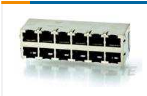
TE Part #5569263-1 STK MJ,8POS,2X6,SHLD,CAT5