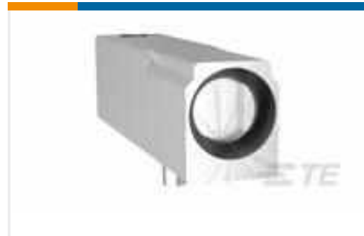
TE Part #5223986-3 UPM KEYED GUIDE MODULE