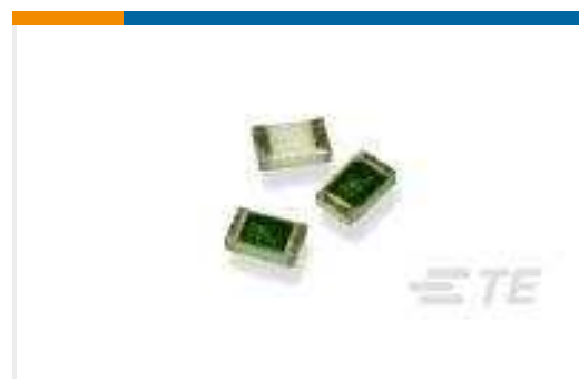
TE Part #2-1879214-0 CPF 0402 511R 0.1% 25PPM 1K RL