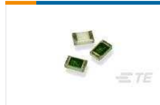
TE Part #7-1879215-3 CPF 0402 26K1 0.1% 25PPM 1K RL