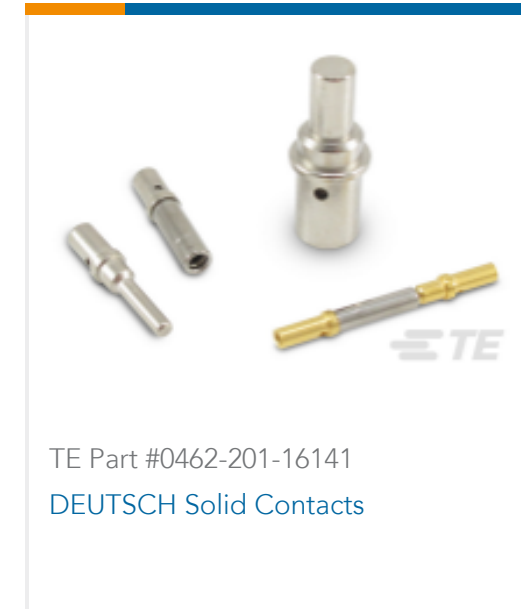
TE Part #0462-201-16141 DEUTSCH Solid Contacts