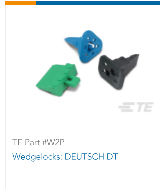
TE Part #W2P Wedgelocks: DEUTSCH DT