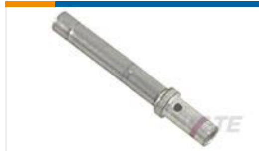
TE Part #0462-005-20309 SOC, SOLID, SIZE 20, 16-18AWG, SN