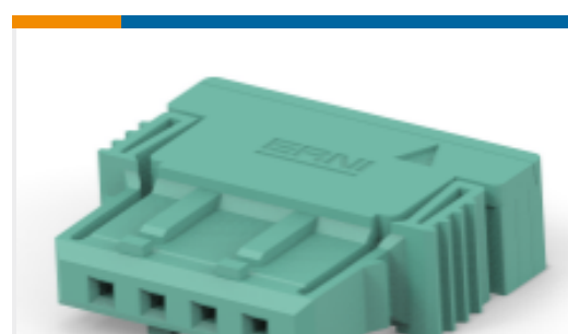
TE Part #384455-E SRCBUG A 2,54 2 4 CSI 164 E1 ADV J 2 324