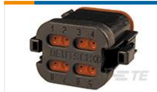
TE Part #DT06-08SB-CE05 PLG, 8P, BLK, E, SEAL RET, CAP, B