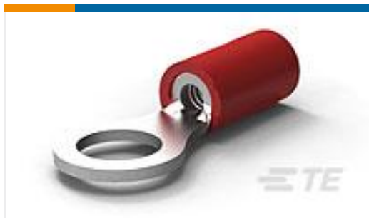
TE Part #130014 TERM, R, PG, 22-16, M5