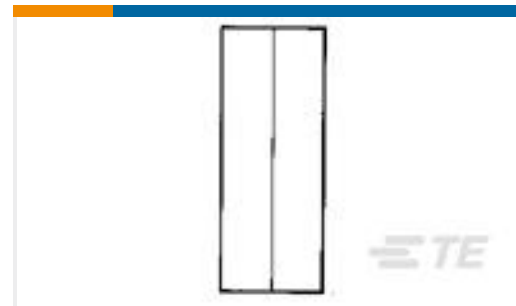
TE Part #34137 SPLICE,SOLIS PARA BRZD 16-14