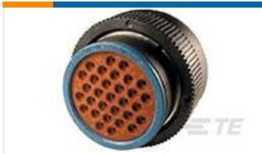
TE Part #HDP26-24-31SE PLG, 31P, BLK, E, 16, S