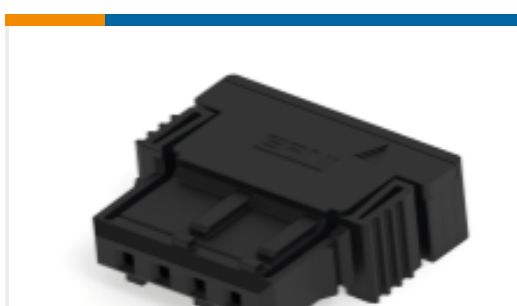
TE Part #384453-E SRCBUG A 2,54 2 4 CSI 112 E1 ADV J 2 324