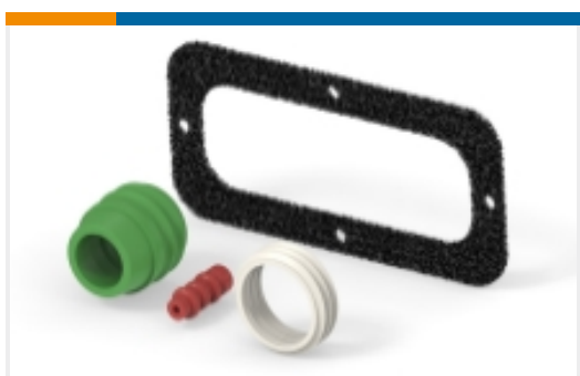
Connector Seals & Cavity Plugs(6)