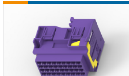
TE Part #1-2112891-2 36POS,TAB 1.5X0.6,TAB HSG,ASSY