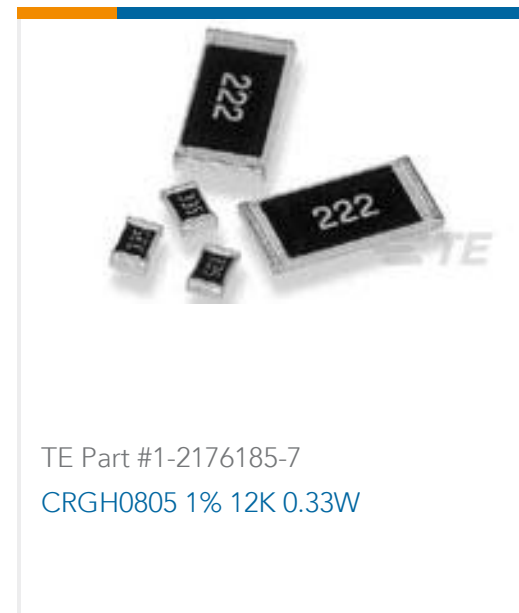
TE Part #1-2176185-7 CRGH0805 1% 12K 0.33W