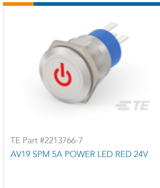
TE Part #2213766-7 AV19 SPM 5A POWER LED RED 24V