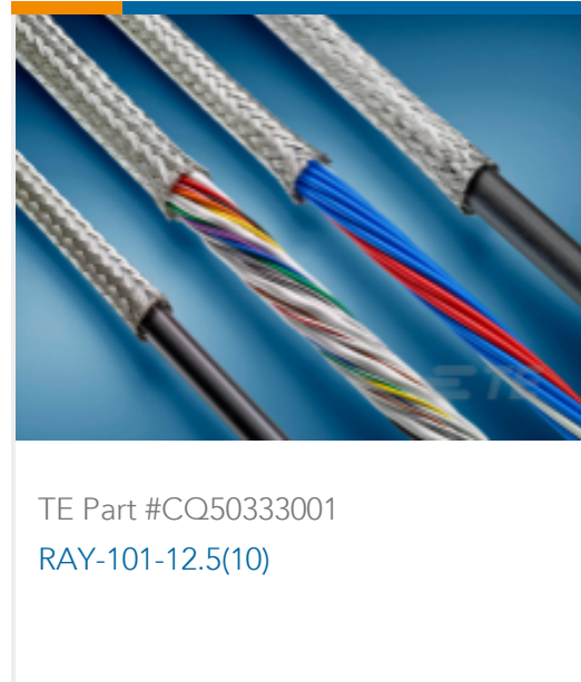
TE Part #CQ50333001 RAY-101-12.5(10)