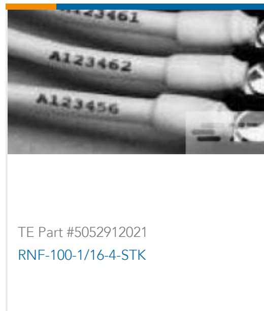
TE Part #5052912021 RNF-100-1/16-4-STK