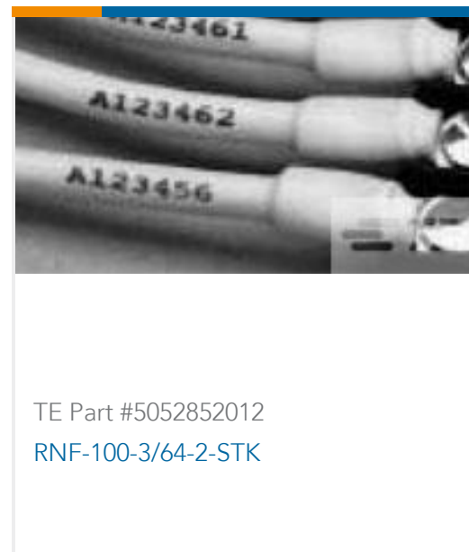
TE Part #5052852012 RNF-100-3/64-2-STK