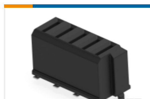
TE Part #214547-E MSPPM 5 F SMD F6 * A V 137 094 * E008 J