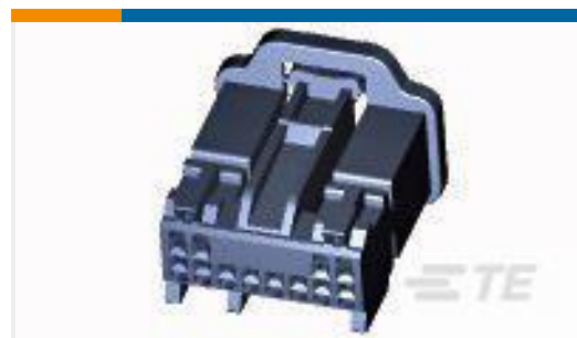
TE Part # 2177587-2 12POS NANO MQS TL PLUG HOUSING, CODE B