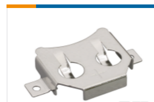
TE Part #BAT-HLD-007-SMT-TR Holder 1216 1220 1225 SMT T&R Pack