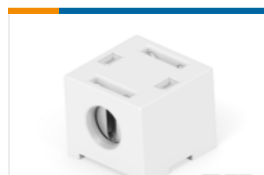
TE Part #454302-E IDCTERM 1 IDC22 1,30 * 105 707 0007 J 2