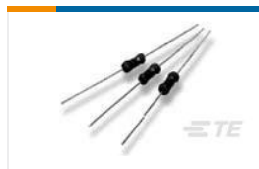
TE Part #1879351-6 RR01 5% 4K7 AMMO