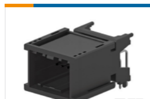
TE Part #2177367-3 Miniature Automotive I/O Headers