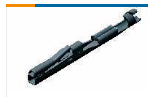
TE Part #2-1703930-1 NANOMQS, RECEPTACLE TERMINAL