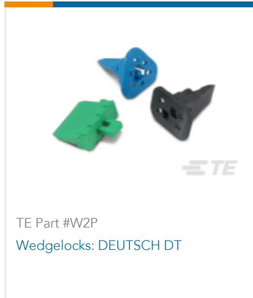
TE Part #W2P Wedgelocks: DEUTSCH DT