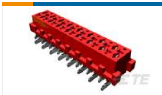
TE Part #9-188275-0 MICRO-MATCH SMD FTE