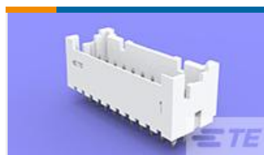
TE Part #2-1969584-8 ASSY,HDR,VERT,GWT,NO-BOSS, DUAL ROW,EP2.5