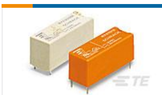
TE Part #8-1393224-2 RY531024