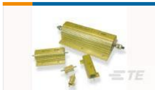
TE Part #1-1625971-5 HSA25 1K2 5%