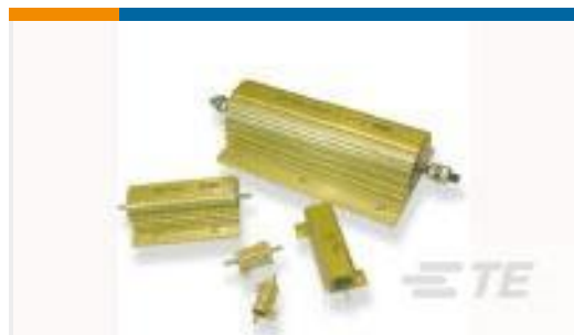
TE Part #4-1625999-9 HSC100 8R2 5%