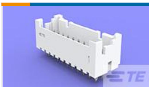
TE Part #1-1969543-4 ASSY, HDR, VERT, BOSSSED, DUAL ROW, EP2.5