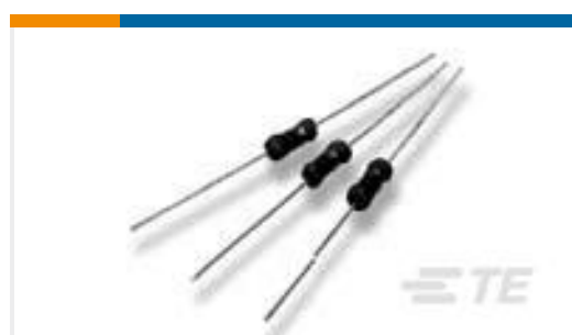
TE Part #5-1625892-3 3W SM M/OX 5% 47K