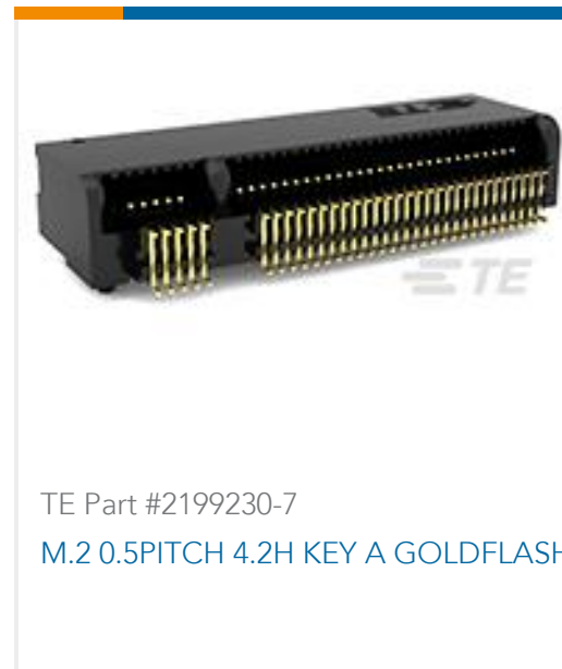
TE Part #2199230-7 M.2 0.5PITCH 4.2H KEY A GOLDFLASH