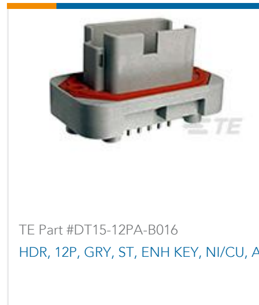
TE Part #DT15-12PA-B016 HDR, 12P, GRY, ST, ENH KEY, NI/CU, A