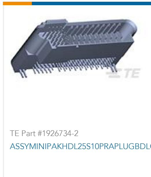
TE Part #1926734-2 ASSYMINIPAKHDL25S10PRAPLUGBDLCK