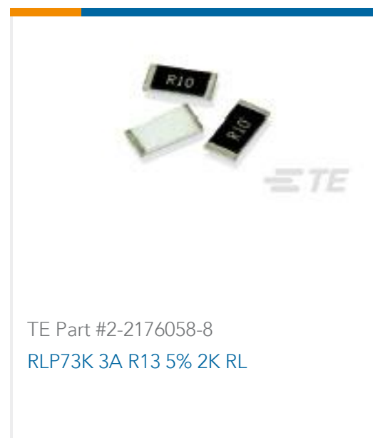
TE Part #2-2176058-8 RLP73K 3A R13 5% 2K RL