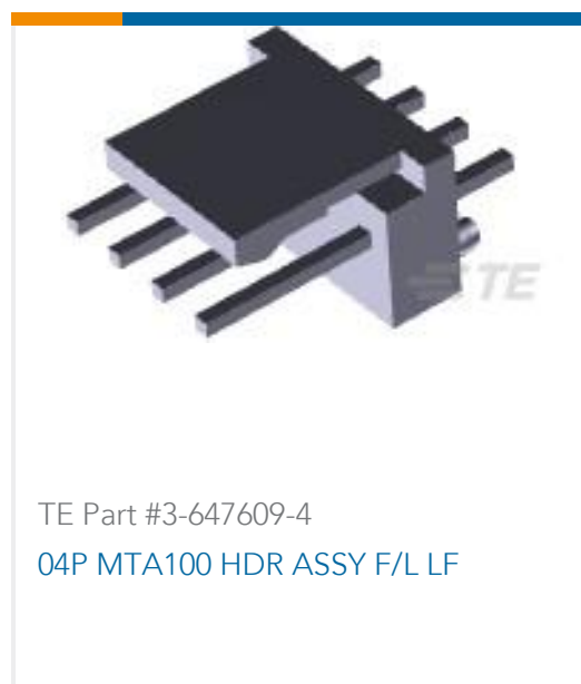
TE Part #3-647609-4 04P MTA100 HDR ASSY F/L LF