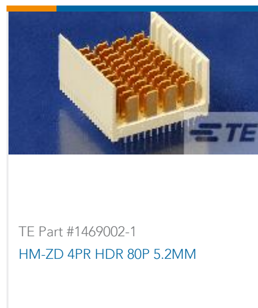
TE Part #1469002-1 HM-ZD 4PR HDR 80P 5.2MM