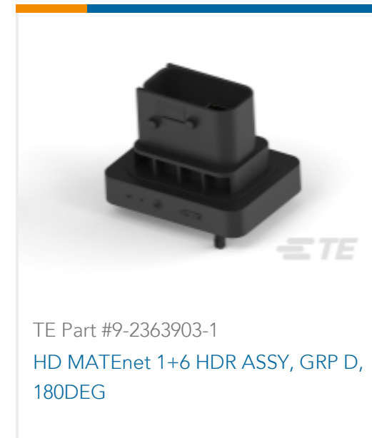
TE Part #9-2363903-1 HD MATEnet 1+6 HDR ASSY, GRP D, 180DEG