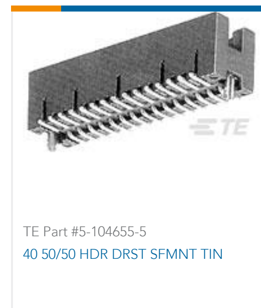
TE Part #5-104655-5 40 50/50 HDR DRST SFMNT TIN