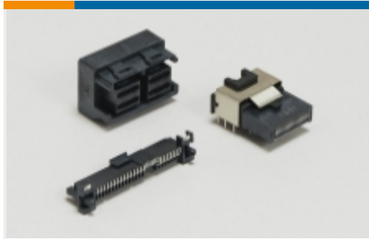
SAS & MiniSAS(30)