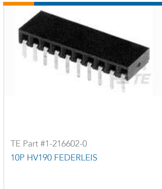
TE Part #1-216602-0 10P HV190 FEDERLEIS