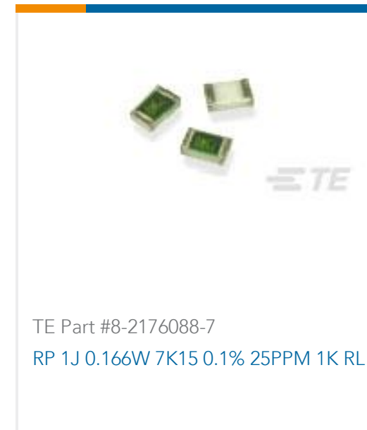
TE Part #8-2176088-7 RP 1J 0.166W 7K15 0.1% 25PPM 1K RL