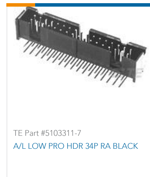
TE Part #5103311-7 A/L LOW PRO HDR 34P RA BLACK