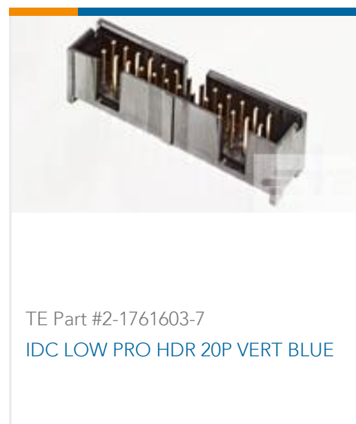
TE Part #2-1761603-7 IDC LOW PRO HDR 20P VERT BLUE