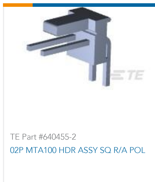
TE Part #640455-2 02P MTA100 HDR ASSY SQ R/A POL