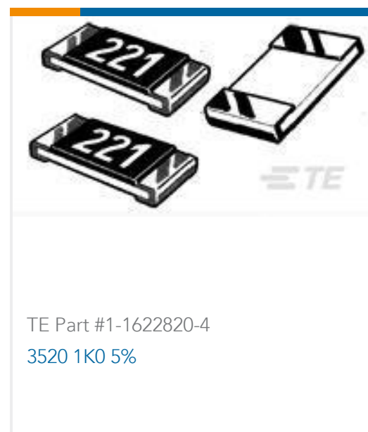
TE Part #1-1622820-4 3520 1K0 5%