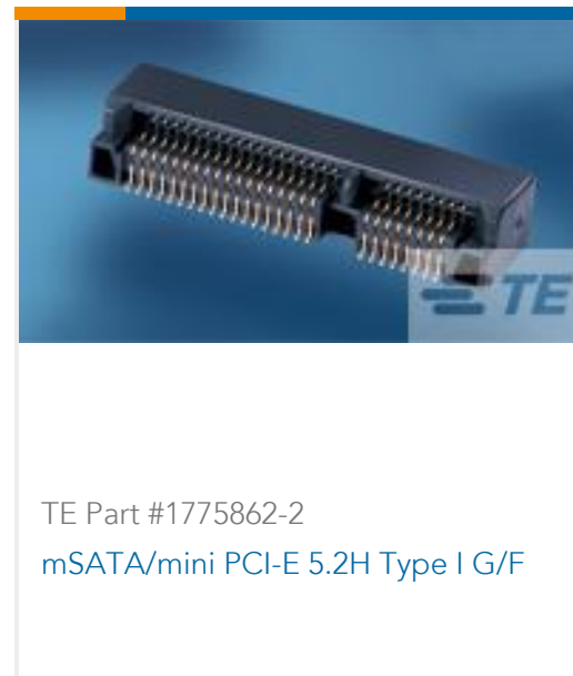
TE Part #1775862-2 mSATA/mini PCI-E 5.2H Type I G/F