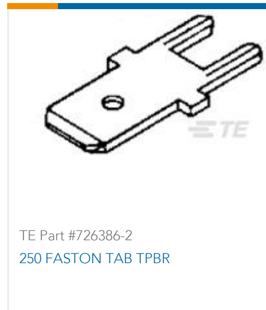
TE Part #726386-2 250 FASTON TAB TPBR