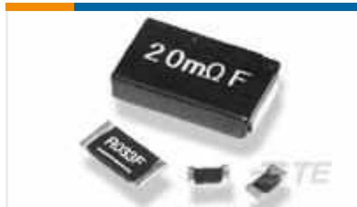
TE Part #1879378-9 TLR 2512 2.0W R001 1% 50PPM 2K RL