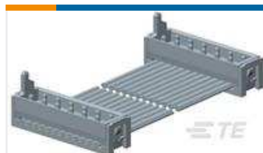
TE Part #1483354-3 MICRO-MATCH LEAD 12P 250MM