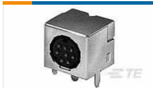
TE Part #5749265-1 Mini DIN, 6 pos, R/A, Shield