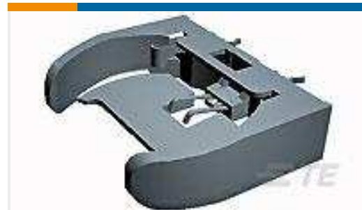
TE Part #1775485-1 Battery Holder, 3.6mm, BLK, low profile