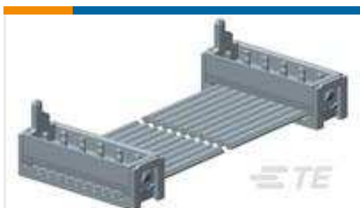
TE Part #1483353-3 MICRO-MATCH LEAD 10P 250MM