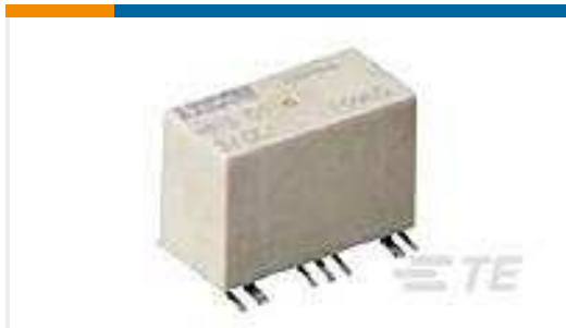
TE Part #1462050-1 HF301=75OHM140MW 3V MONO