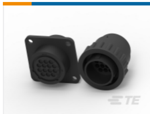
TE Part #182920-1 CPC EMEA