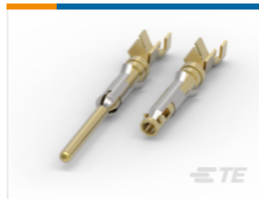
TE Part #163088-1 Pin and Socket Contacts, Type III, LP EMEA