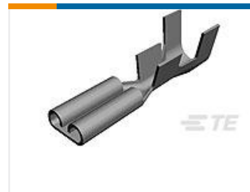
TE Part #170213-3 250 FASTON,REC.,18-14 AWG,TPPB EMEA