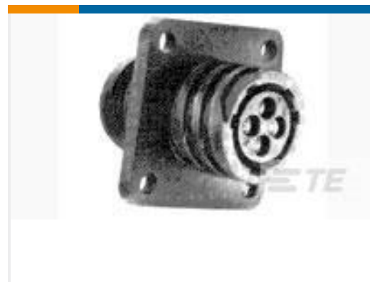
TE Part #206043-1 RECEPT,SZ 17-14 CPC