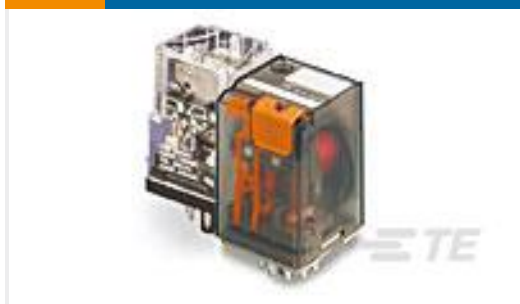
TE Part #5-1393104-1 KRPA-11DN-24=KRPA