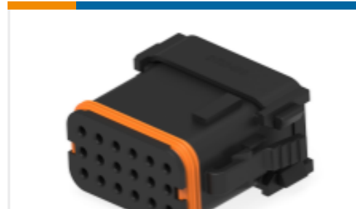
TE Part #DT16-18SA-K004 PLG, 18P, BLK, E, A