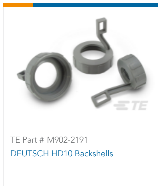
TE Part # M902-2191 DEUTSCH HD10 Backshells