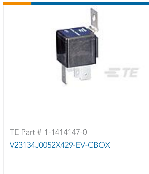
TE Part # 1-1414147-0 V23134J0052X429-EV-CBOX