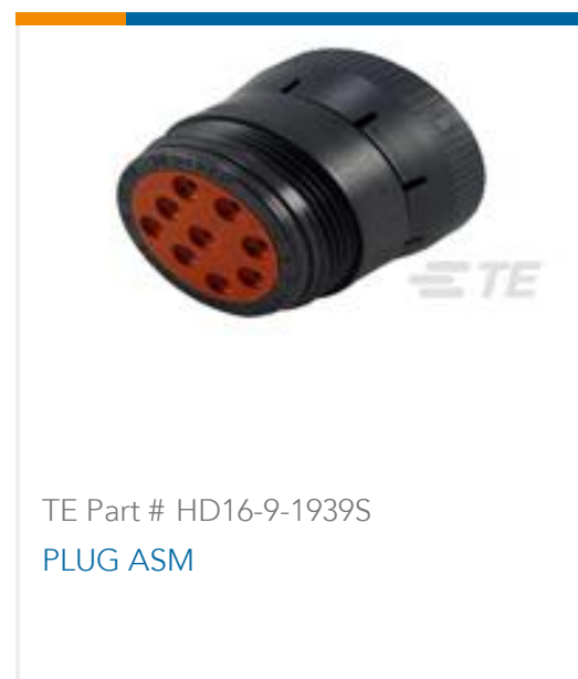
TE Part # HD16-9-1939S PLUG ASM