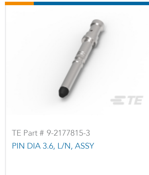
TE Part # 9-2177815-3 PIN DIA 3.6, L/N, ASSY