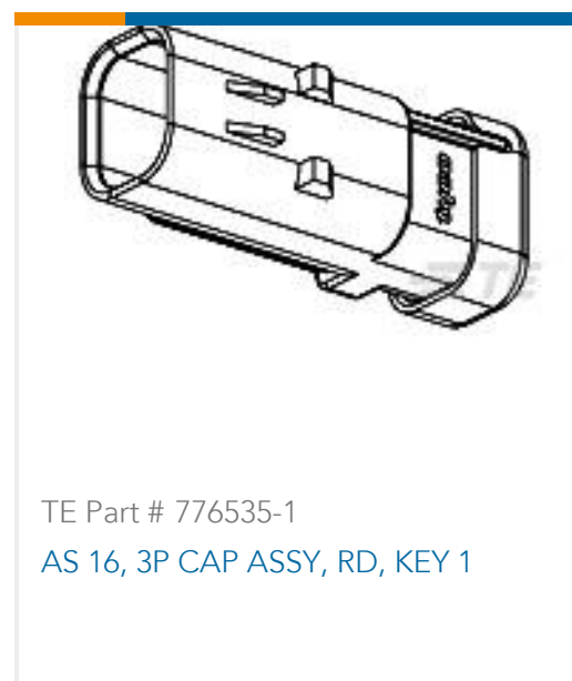
TE Part # 776535-1 AS 16, 3P CAP ASSY, RD, KEY 1