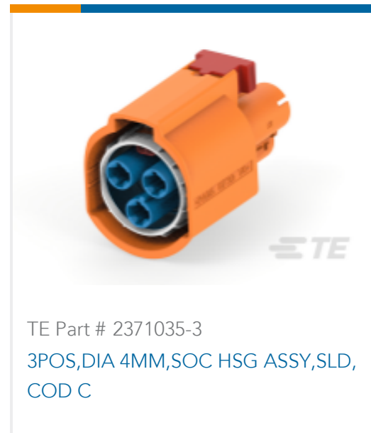
TE Part # 2371035-3 3POS,DIA 4MM,SOC HSG ASSY,SLD, COD C