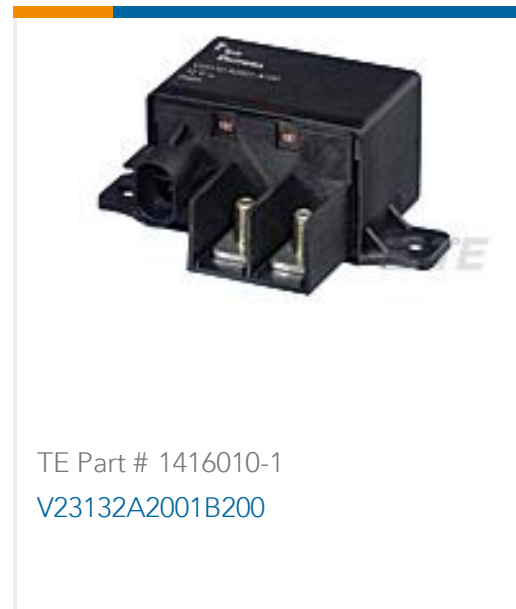
TE Part # 1416010-1 V23132A2001B200