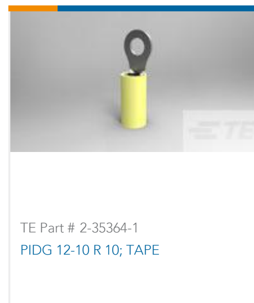
TE Part # 2-35364-1 PIDG 12-10 R 10; TAPE