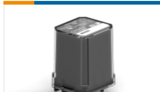
TE Part #3-1415546-7 RM727024