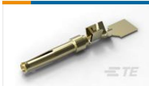
TE Part #166051-1 24-20 AWG HD-20 SOCKET