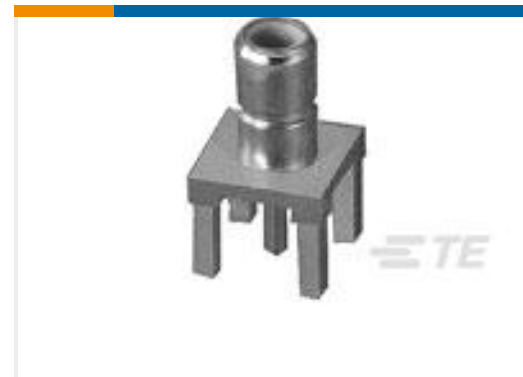
TE Part #413990-1 STR JACK, SMB, PCB