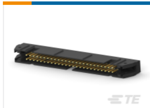
TE Part #5102321-1 AMP-LATCH UNIVERSAL HEADERS