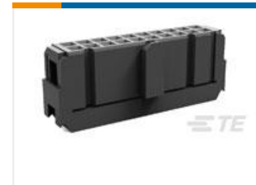
TE Part #1658621-4 20 NOVO MIL/CTR 15DP, LEAD FREE