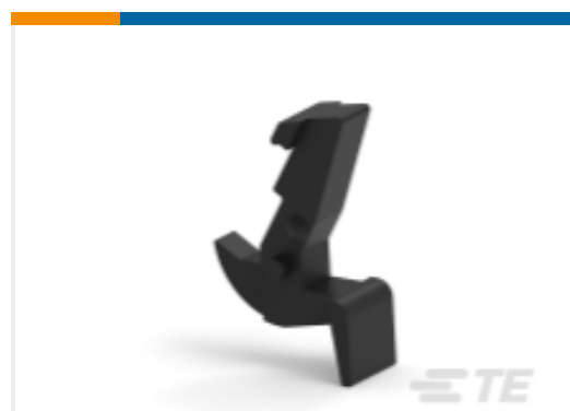
TE Part #102312-1 Universal Headers: Ejector Latch