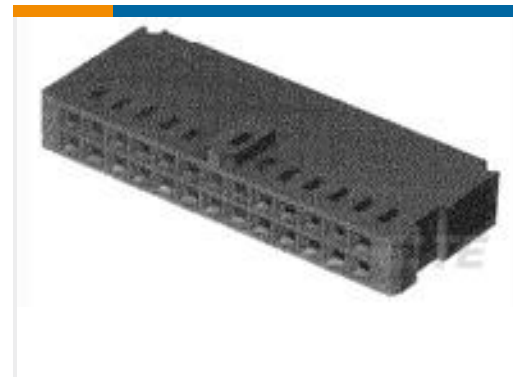
TE Part #1-102387-0 50 MODIV HSG COMP DR .100 POL