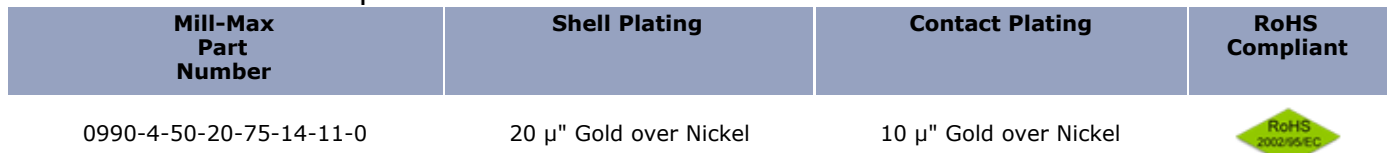
0990-X-50-20-75-14-11-0 Standard stroke, Surface mount Large Base