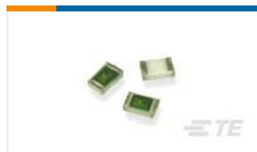
TE Part #1676271-1 RN 0805 26K1 0.1% 10PPM CUT LENGTH