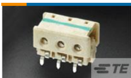
TE Part #1-2106489-1 Connector, Thru Hole-IDC, 1 pos, 20AWG