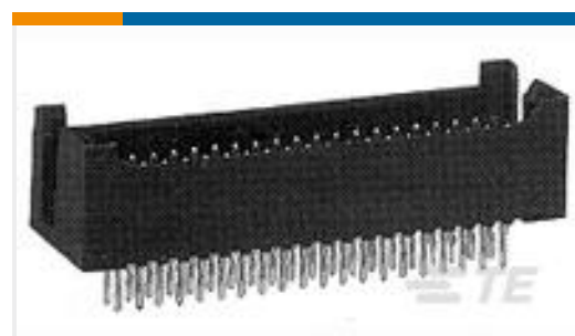
TE Part #1-102567-3 30 MODII 2PC HDR DR SHRD .100