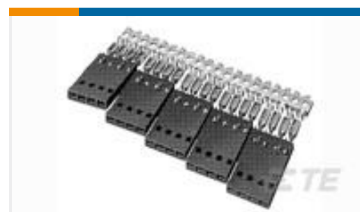
TE Part #104439-2 5X3 MTE RCPT SR PLAIN .100CL