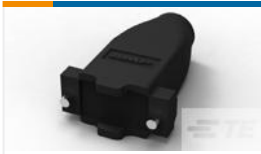
TE Part #5745854-3 CABLE CLAMP KIT, SZ 1