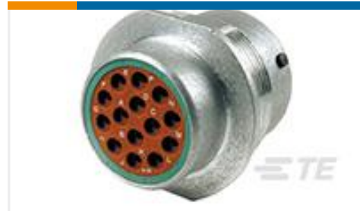
TE Part #HD34-18-14PN REC, 14P, AL, N, 16, P