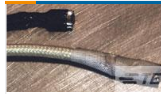
TE Part #1719534002 RT555-2-0-SP