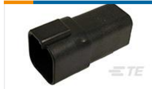
TE Part #DT04-6P-E004 REC, 6P, BLK, N