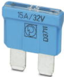
Flat-type plug-in fuse, type C, color code: pink, nominal current: 4 A

Please be informed that the data shown in this PDF Document is generated from our Online Catalog. Please find the complete data in the user's documentation. Our General Terms of Use for Downloads are valid ( http://phoenixcontact.com/download )