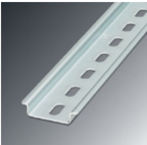
DIN rail, material: Steel, uncoated, perforated, height 7.5 mm, width 35 mm, length: 2 m

Please be informed that the data shown in this PDF Document is generated from our Online Catalog. Please find the complete data in the user's documentation. Our General Terms of Use for Downloads are valid ( http://download.phoenixcontact.com )