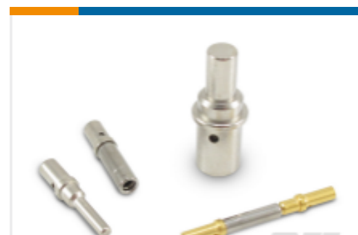
TE Part #0462-201-16141 DEUTSCH Solid Contacts