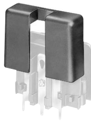
E.g. Rear cover for GSF1