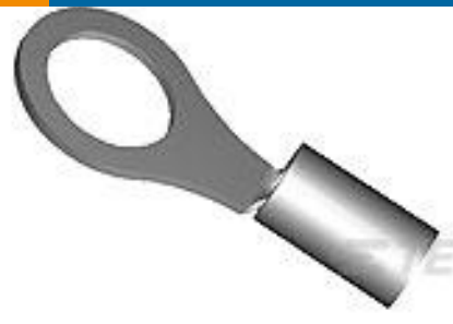
TE Part #324056 TERMINAL,T-N R 1/0 1/4