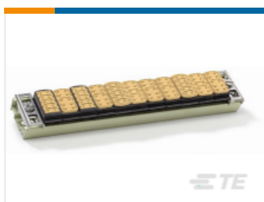
TE Part #ZPF0000000000020144 FMJ 11E 20-02 G