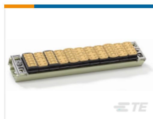
TE Part #ZPF0000000000020160 FMJ 11E 20-11 G