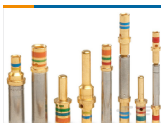
TE Part #ZPF000000000000363 006-0937-20